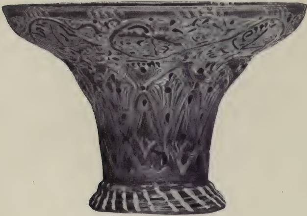
BEAKER, OR POKAL BOWL Barcelona Seventeenth Century